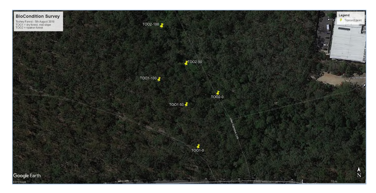
Figure 2 BioCondition transect points for two sites in Toohey Forest. University Road runs along the bottom of the frame.

Two BioCondition transects were chosen to represent distinctive landscape positions across a moisture gradient from a wet gully to dry ridge-top (see Figure 2 ). Site TOO1 was placed along a mid-slope contour to represent the drier forest type, while Site TOO2 was placed along the creek-flat to represent the moist riparian forest type. These two transects cut approximately perpendicularly across a moisture-gradient transect established by TFEEC for their teaching activities.